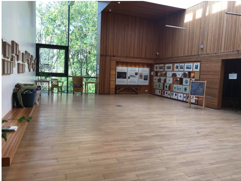
Photo showing the Storytelling Court with no furniture.