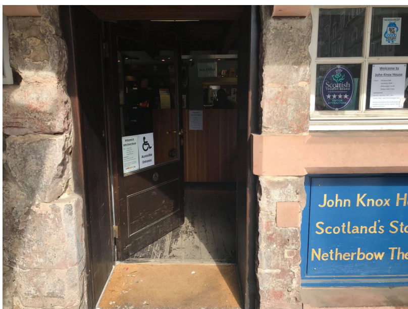
A photo showing the level access door to the centre and John Knox House