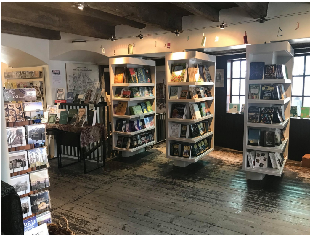
Photo showing some of the shelves in the bookshop