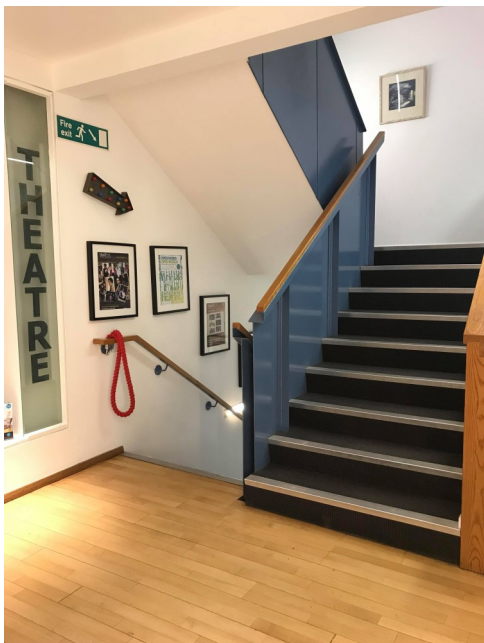
Photo showing the well lit stairs that lead to the Theatre.