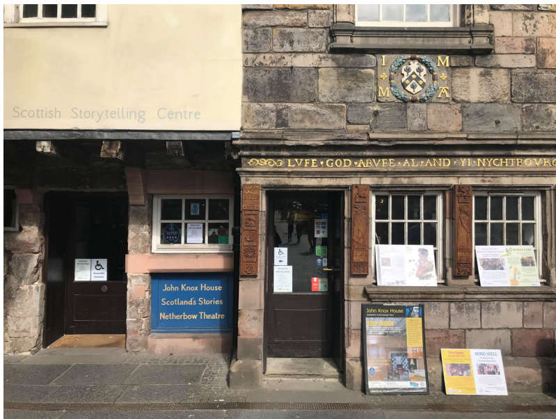
A photo showing the two doors at the John Knox House entrance