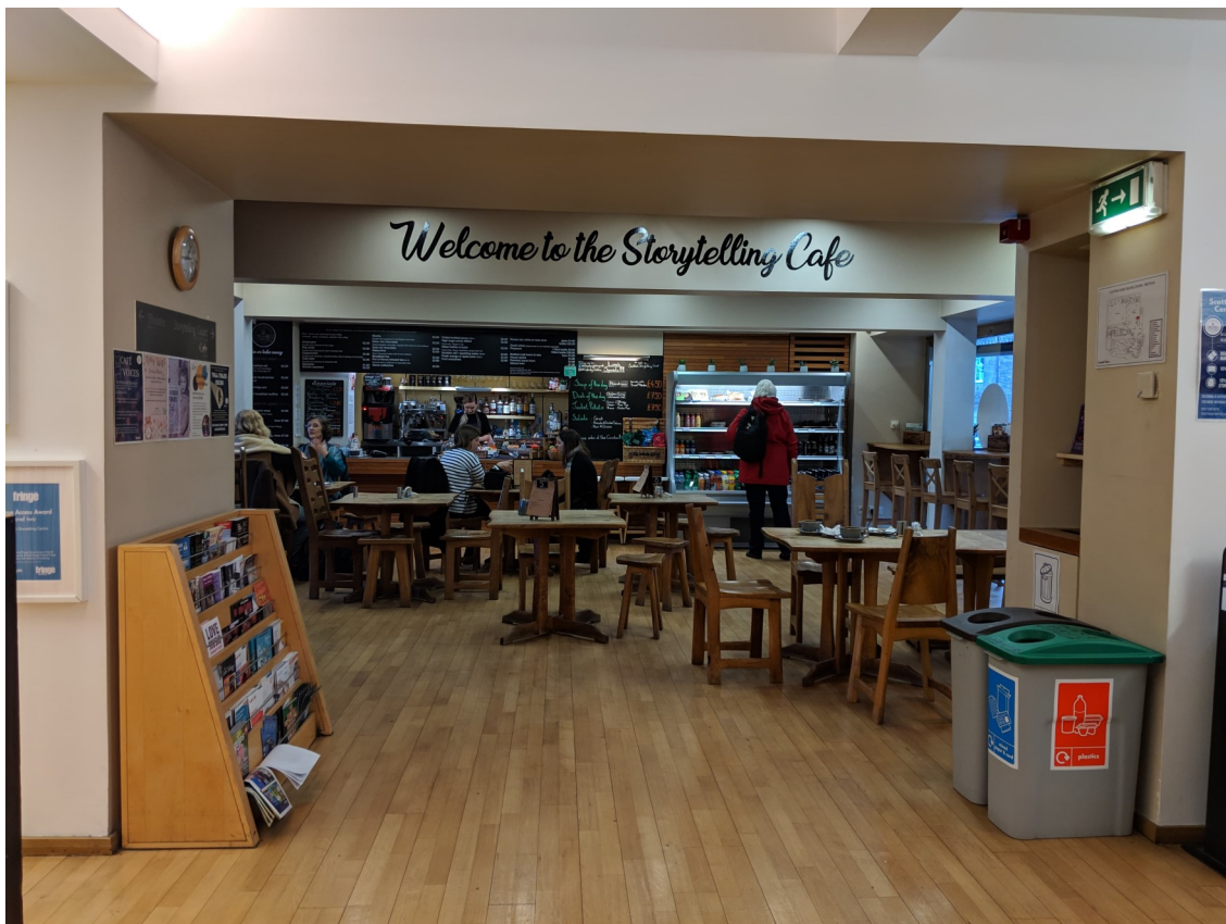
Photo showing the Café from the Reception area