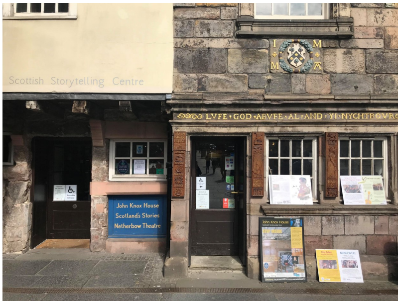
A photo showing the two doors at the John Knox House entrance