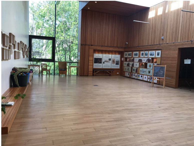
Photo showing the Storytelling Court with no furniture.