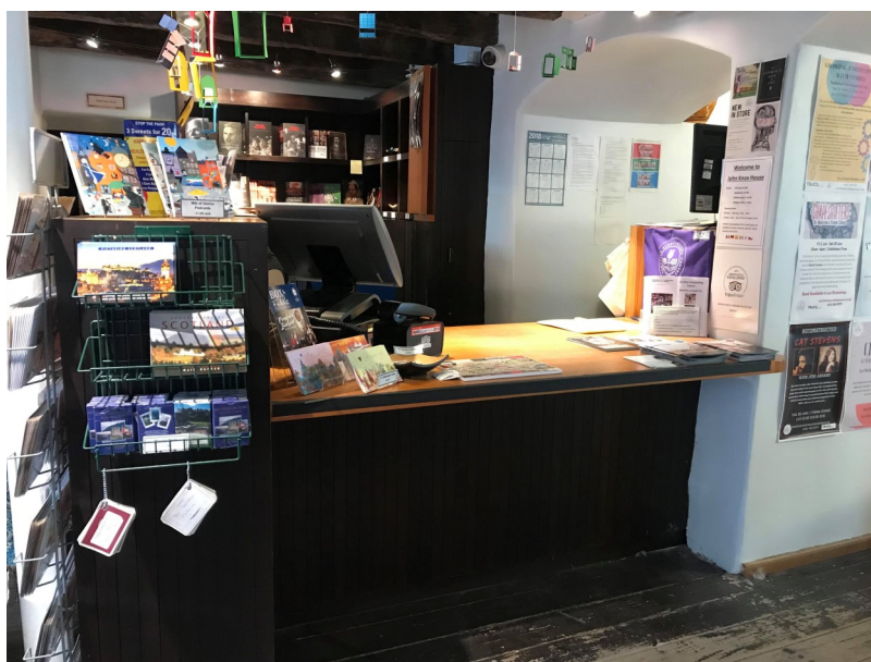
A photo showing the lowered side of the counter at the reception desk