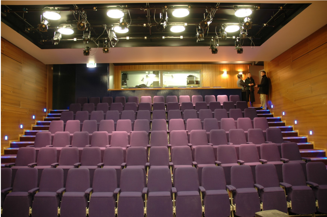
Photo shows raked audience seating area from the stage