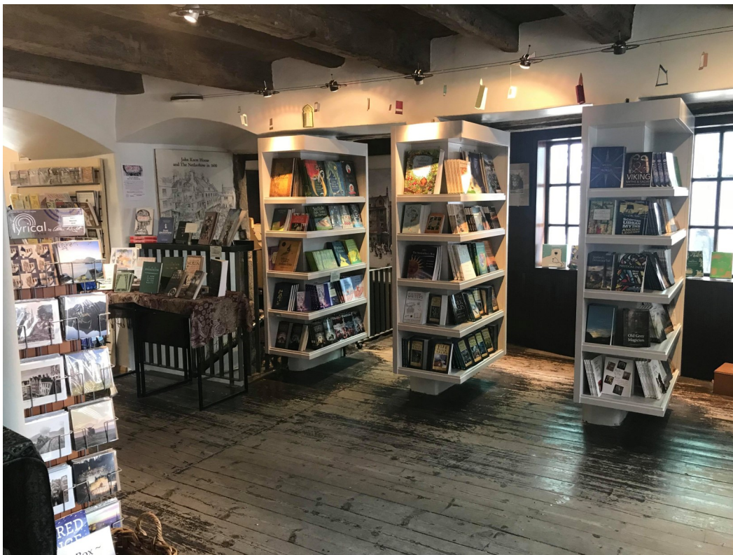
Photo showing some of the shelves in the bookshop