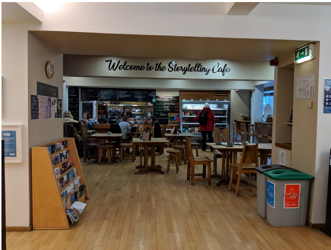
Photo showing the Café from the Reception area