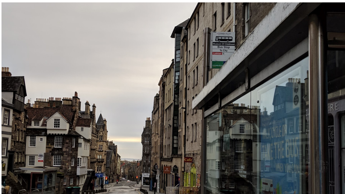
Photo showing one of the nearest bus stops in relation to the centre