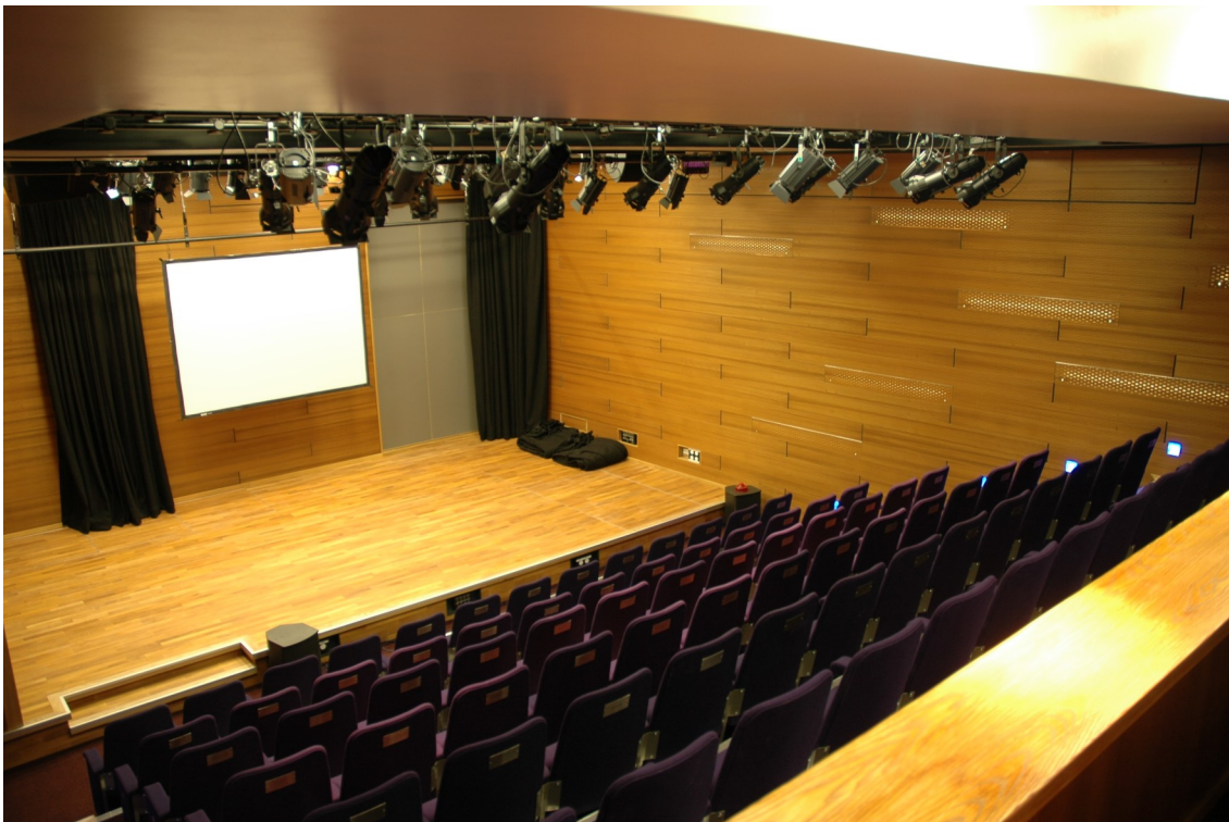
Photo shows full raked audience seating area and stage from the main theatre entrance door