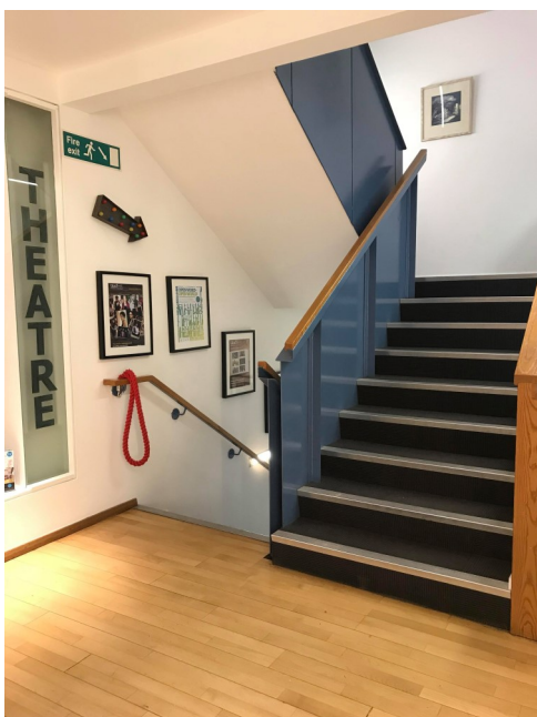
Photo showing the well lit stairs that lead to the Theatre.