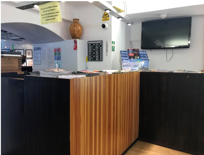
Photo shows the other side of the reception and box office area. There is no lowered counter on this side.