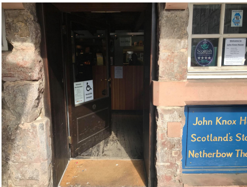
A photo showing the level access door to the centre and John Knox House