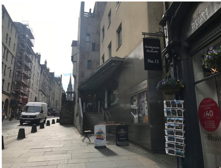
A photo showing the Main Building entrance and the wide pavement