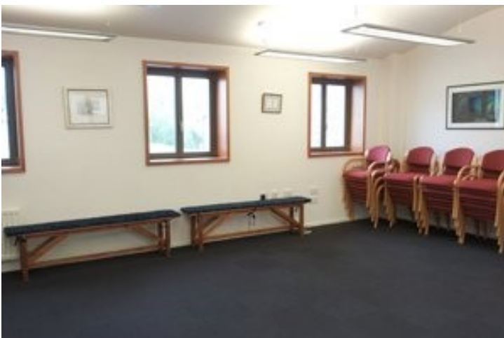
Photograph of the Traditional Arts Hive with furniture pushed to the sides of the room.