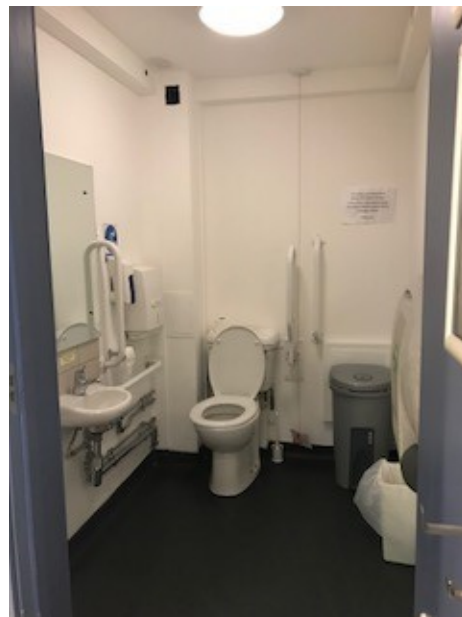
Two photos showing the interior of the accessible toilet on the ground floor