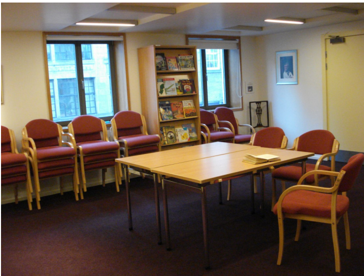
Photo showing the George Mackay Brown Library set for a small meeting.