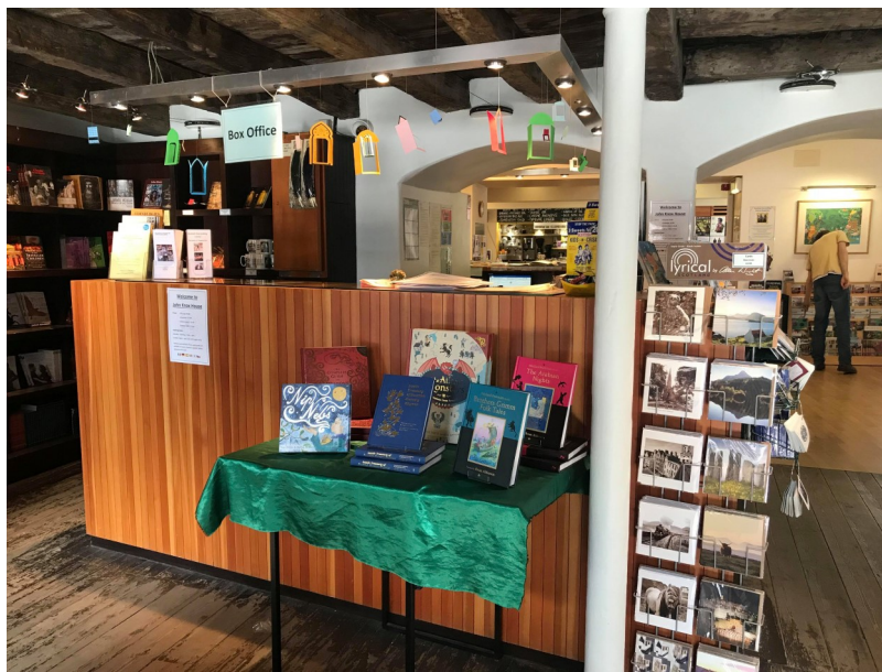
A photo showing the raised side of the counter at the reception desk